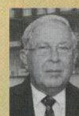
Y.K. Hamied Chairman Cipla Ltd