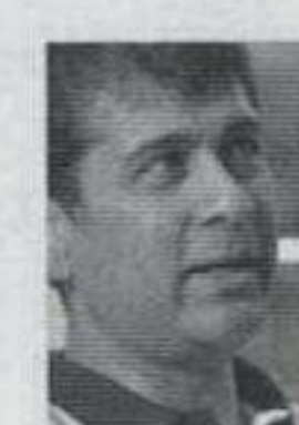
Rajiv Bajaj Managing Director Bajaj Auto Ltd