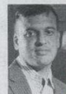
Rajeev Jain Chief Executive Officer Bajaj Finance Ltd