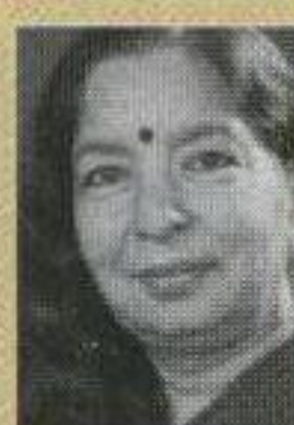
Shikha Sharma Managing Director & CEO Axis Bank Ltd