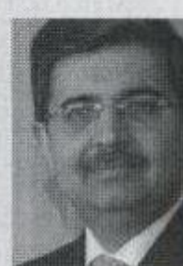
Uday Kotak Executive Vice Chairman & MD Kotak Mahindra Bank Ltd