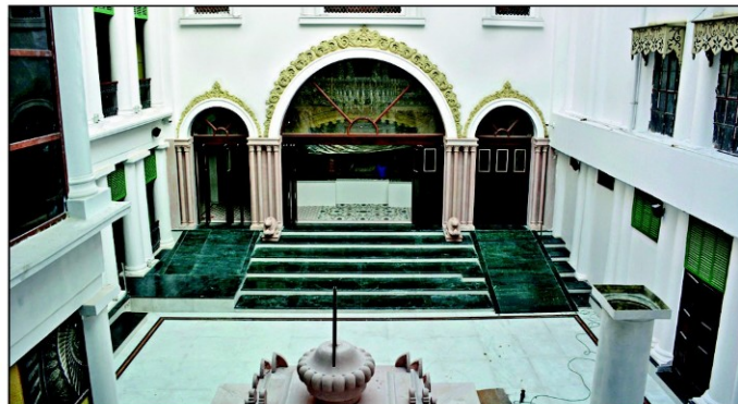
The original look of the building 180 years ago is being restored